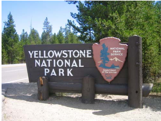
Welcome to Yellowstone