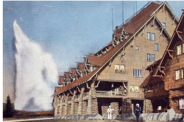
Postcard of Old Faithful Inn & Geyser Frank J Haynes; No date