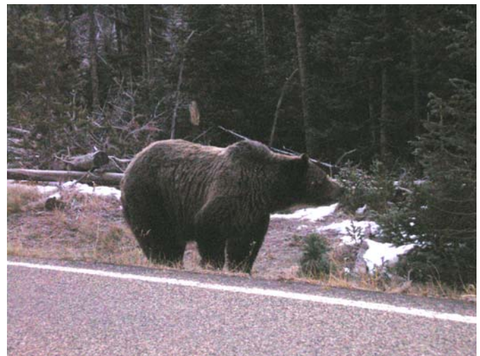
YELLOWSTONE NATIONAL PARK GRIZZLEY

The Big Sky Chapter meeting on October 23, 2007 provided members and guests the opportunity to register for continuing education credits, and with assistance from the CSI NW Region, we were also able to offer AIA continuing education credits. If you missed it . . . you also missed out.