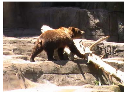
Alaskan Brown Bear 2009

We are approaching the 3rd anniversary of the creation of the Big Sky Chapter. For the good of the order, we need members to step up and help get our chapter moving in the right direction.