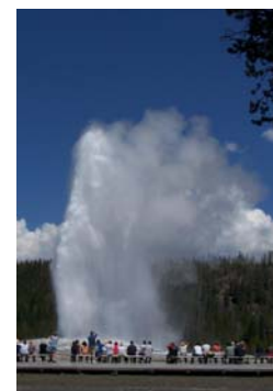
Old Faithful Geyser Yellowstone National Park

Big Sky Chapter of CSI Move into the "Know Zone" and out of the "no zone"